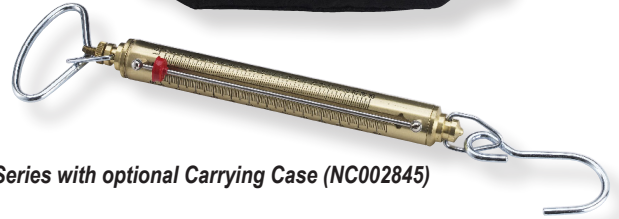
IN Series with optional Carrying Case (NC002845)